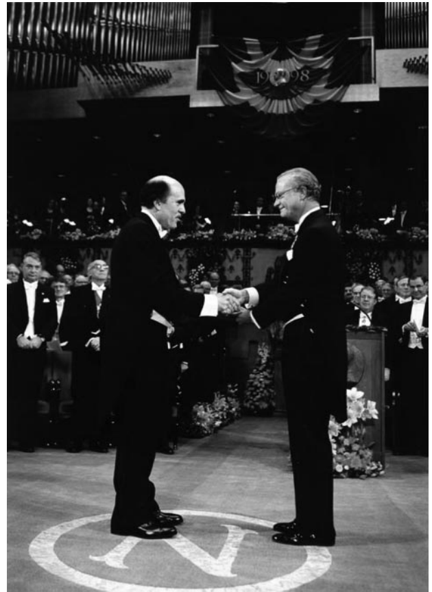
Figure 2. Louis Ignarro accepting the 1998 Nobel Prize in Medicine or Physiology.

I never give up! But after the first year, I did think about switching projects. I talked to Julius Axelrod about working in his laboratory, but with only a year left, it was deemed a bad decision to switch. So, I stayed and got the most that I could out of it.