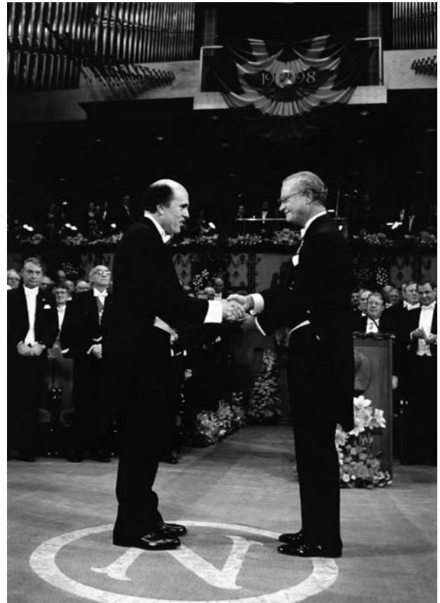
Figure 2. Louis Ignarro accepting the 1998 Nobel Prize in Medicine or Physiology.

I never give up! But after the first year, I did think about switching projects. I talked to Julius Axelrod about working in his laboratory, but with only a year left, it was deemed a bad decision to switch. So, I stayed and got the most that I could out of it.